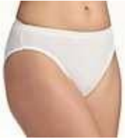
3dhicwh Size Chart