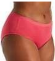
Ultra Light Brief Panty - plulbf Size Chart