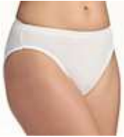
3dhicwh Size Chart